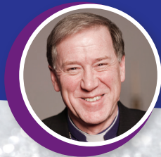
Fred Hiltz Chair, Anglican Foundation Primate of Canada