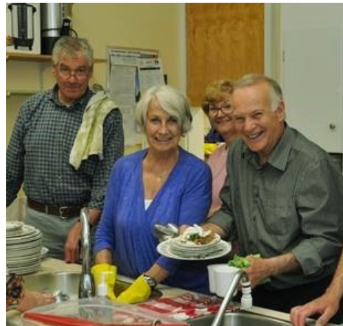
Volunteers at St. Brice's, a 2021 AFC grant recipient, where the kitchen is a joyful, busy place.