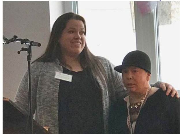
At a 2019 funding announcement, one Cornerstone resident said, "Thank you for giving me a home when I had nothing."

AFC has heard the growing concern about COVID-19's potential long-term impacts on young people. With the continued generosity of Canadian Anglicans, we will take a leadership role in mobilizing a compassionate and courageous response.