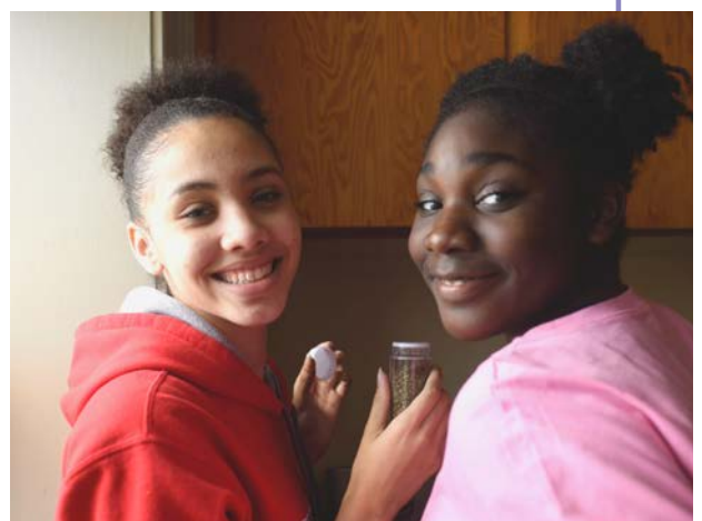
Saint George's YouthNet's teen program provides a safe, supportive place for vulnerable youth in Halifax's North End.