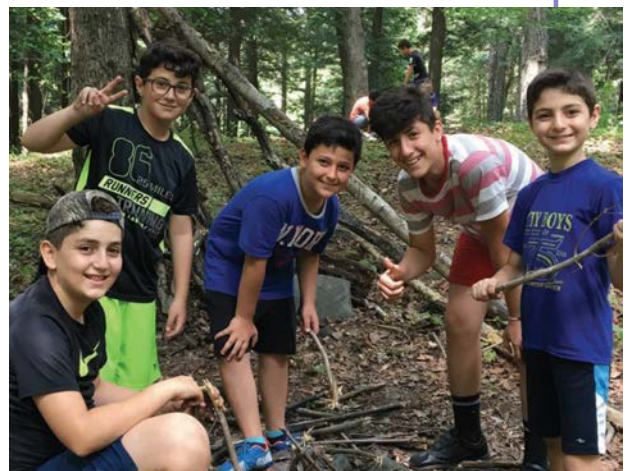
Newcomer children to Canada enjoying the benefits of teamwork and survival training at Quebec Lodge.