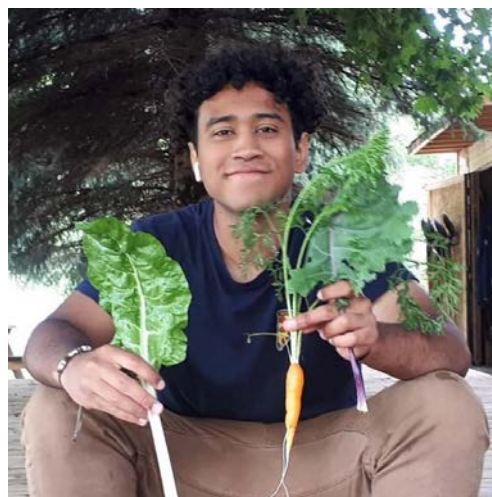
The Common Table's 2020 harvest fed more than 1,500 people in Toronto Community Housing neighbourhoods.