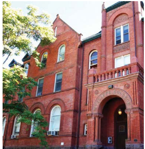
AFC is a proud supporter of Wycliffe College's annual Preaching Day.