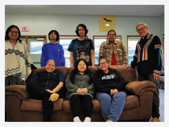
The second Sacred Beginnings gathering brought together an inter-generational delegation from Indigenous communities in Saskatchewan and Manitoba.

"It is certainly our hope that the 2024 campaign will prove similarly impactful, and that AFC's national youth-centred campaign can continue to fund the priorities of Indigenous youth within