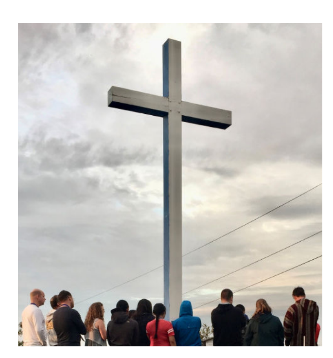
The Diocese of the Arctic exceeded its campaign goal of $3,500 for the Teens Encounter Christ program.

Since 2021, the SYTK movement has raised over $700,000 for youth-focused ministry and outreach across the Anglican Church of Canada. In addition to the local beneficiaries, these combined efforts have also provided $40,000 in funding for national Indigenous youth programs. **