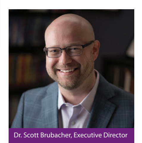
Joys of Giving, Receiving,