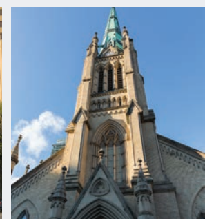
Cathedrals in alphabetical order (L–R, top to bottom) by city: Corner Brook, Edmonton, Gander, Iqaluit, Kenora, Kingston, Ottawa, Quebec, Regina, Toronto.